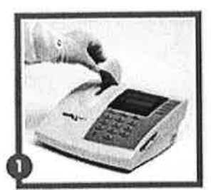
Open the cover

VerifyNow results are comparable to platelet aggregometry but are far less time- and labor-intensive.