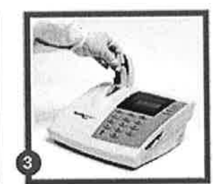
When prompted, insert the tube onto the assay device needle.