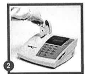
When prompted, insert the assay device until it clicks.