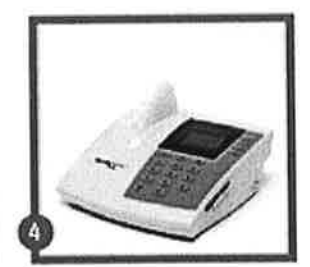
After inserting the tube, close the cover and read results within 2 to 5 minutes.

Replacement instrument for broken old analyzer: $9000.00